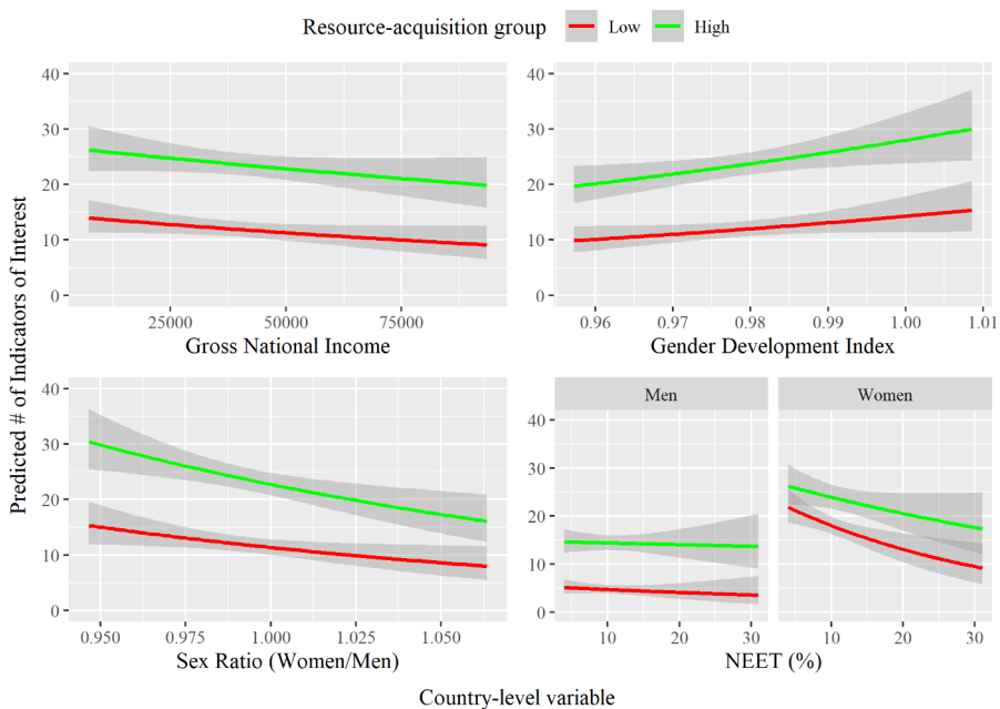
Fig. 3 The predicted difference between high (+1 SD ) vs. low (−1 SD ) resource-acquisition ability on the level of interest a dating profile receives depending on the Gross National Income (GNI), Operational sex ratio (OSR), Gender Development (GDI), and proportion of the population not in education, employment, or training (NEET) of the country the profile sits in. Men and women are plotted separately for NEET due to the involvement of sex in the interaction. Lines are accompanied by ribbons showing 95% confidence intervals

Besides informing on the roles of culture, sex, and resource-acquisition ability on mate choice, we examined how differences in social, political, and economic differences in the various nations accounted for mate choice and sex differences therein. Although we cannot claim our results are definitive (given, e.g., sampling homogeneity in the countries), our results reveal that (1) sex differences persist in all countries sampled and (2) they appear relatively insensitive to the nation-level variables we considered. This may be more in line with evolutionary models of sex differences in mate choice than sociocultural ones because the latter treat sex differences as artifacts of culture (e.g., Eagly & Wood, 1999). Our results showed considerable agreement with studies from labs, smaller datasets, and mate preference research suggesting that even when people are actively choosing mates from the comfort of their couches, regardless of their country of origin, evolved mate selection tendencies are expressed.